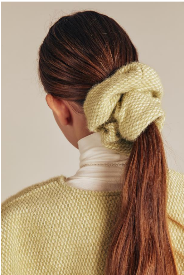
TWEED WOOL SCRUNCHIE (OLIVE) PRICE :17,000 WON