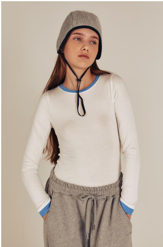
LAYERED TOP (WHITE) PRICE : 26,000WON