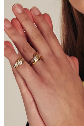
MORRY THREE RING (SILVER&GOLD) PRICE : 83,000WON (1-3호)PRICE : 65,500WON