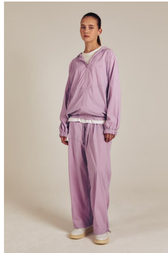
HOUSE ANORAK JACKET (LAVENDER) PRICE :132,000 WON