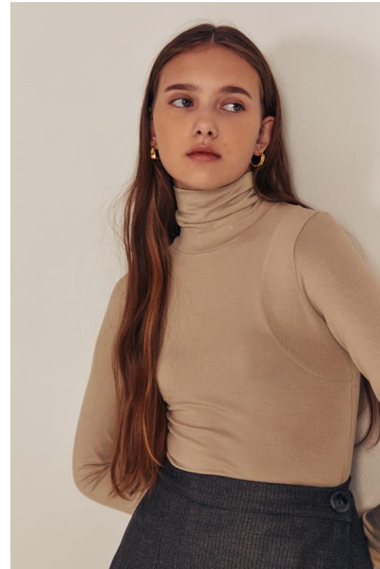
ROUND TURTLENECK SLIM TOP (BEIGE) PRICE : 28,000WON