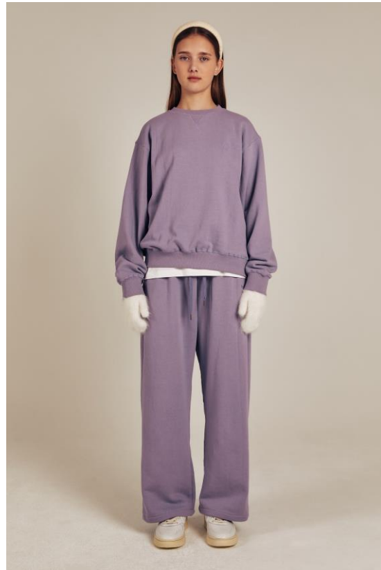
BASIC LOGO SWEATSHIRTS (LAVENDER) PRICE : 68,000 WON