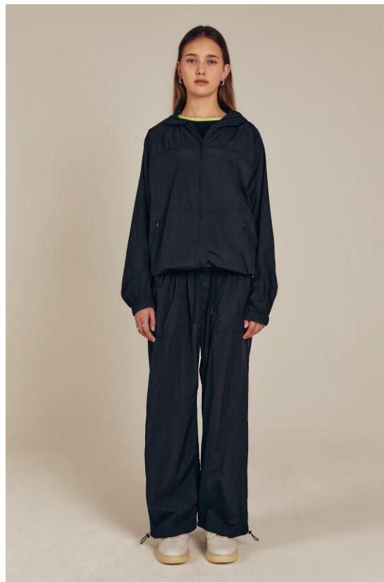
HOUSE ANORAK JACKET (BLACK) PRICE :132,000 WON