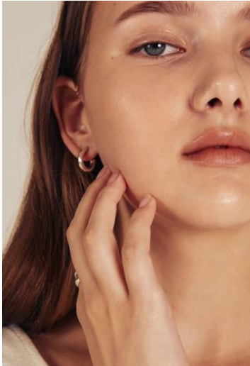
CLASSIC EARRING (SILVER) PRICE : 44,800 WON