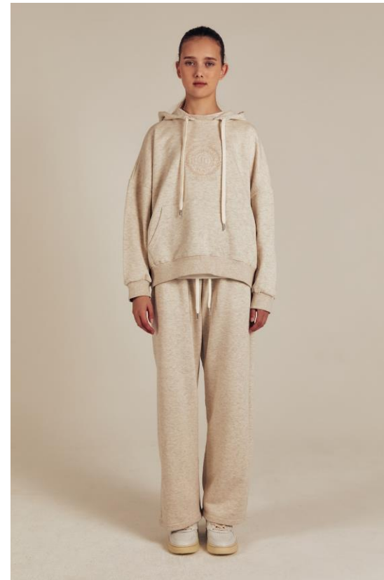
LOVE MUSEUM HOODIE (OATMEAL) PRICE :58,000 WON