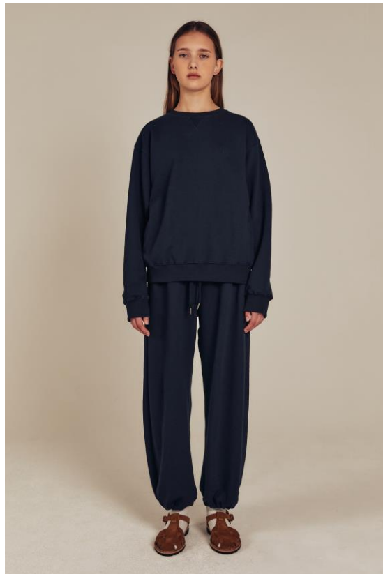
BASIC LOGO SWEATSHIRTS (NAVY) PRICE : 68,000 WON