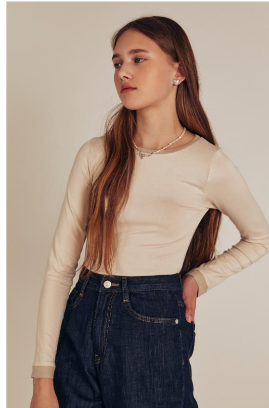
LAYERED TOP (BEIGE) PRICE : 26,000WON