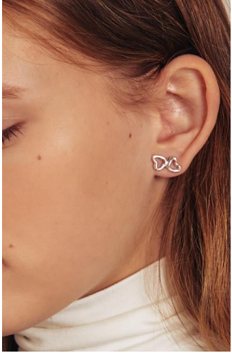
FACE LOVE EARRING (SILVER) PRICE : 45,800 WON