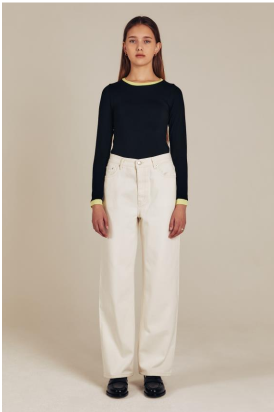
LAYERED TOP (BLACK) PRICE : 26,000WON