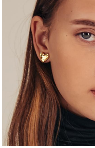
HEART EARRING (GOLD) PRICE : 65,000 WON