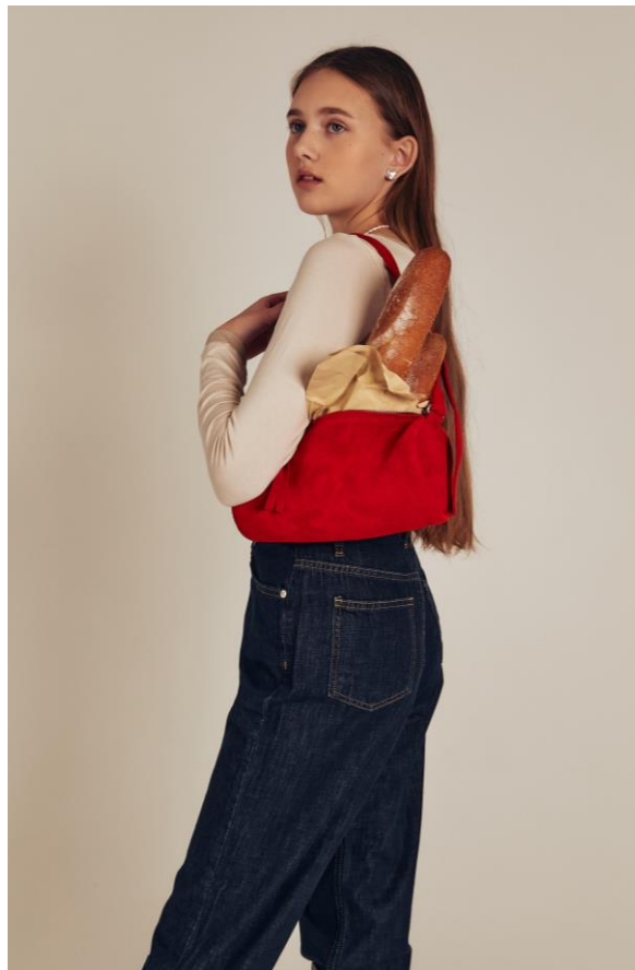
PILLOW BAG (RED) PRICE :158,000 WON