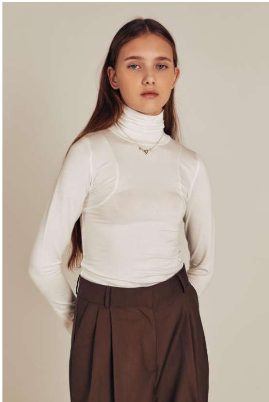
ROUND TURTLENECK SLIM TOP (WHITE) PRICE : 28,000WON