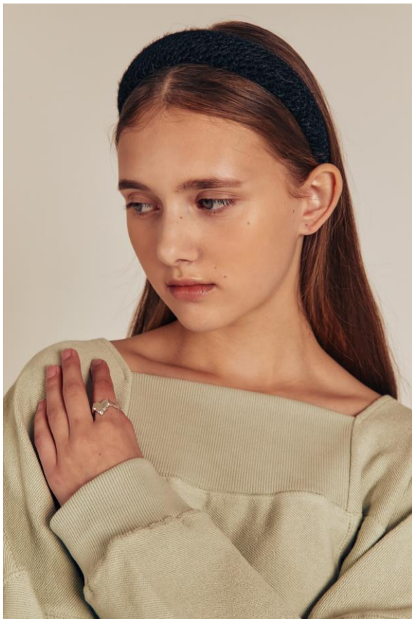
TWEED WOOL HAIRBAND (BLACK) PRICE :16,500 WON