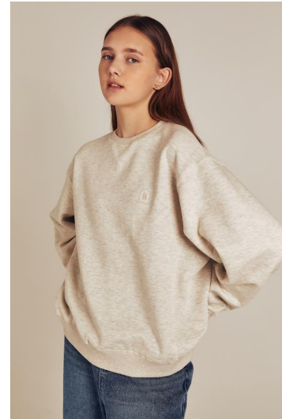
BASIC LOGO SWEATSHIRTS (OATMEAL) PRICE : 68,000 WON