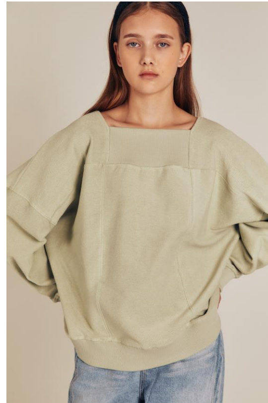
BRUSHING SQUARENECK SWEATSHIRTS (MINT) PRICE : 78,000 WON