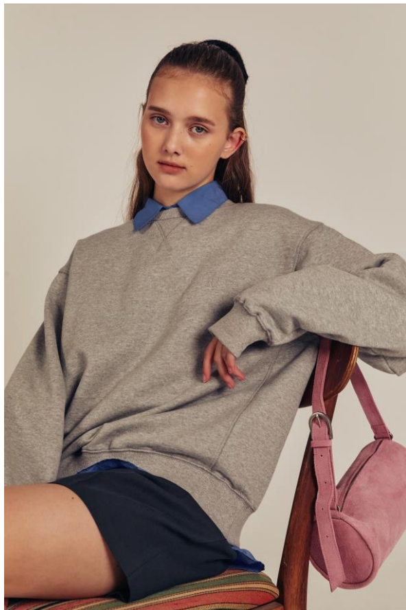
PILLOW BAG (PINK) PRICE :158,000 WON