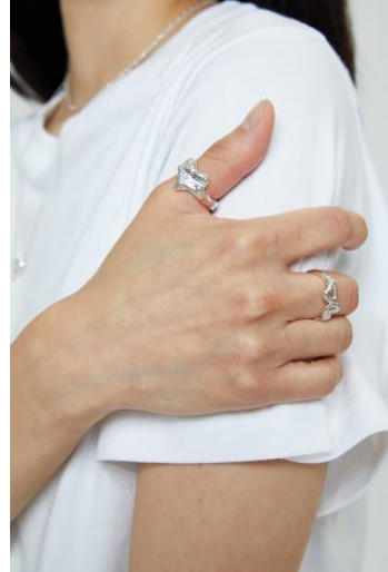
DRAWING LOVE RING (SILVER) PRICE : 58,500WON