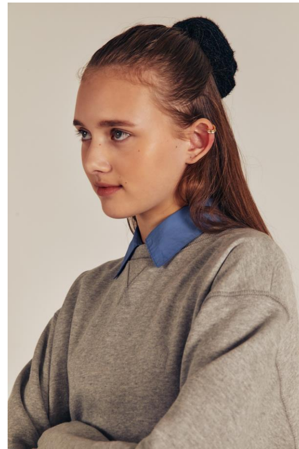
TWEED WOOL SCRUNCHIE (BLACK) PRICE :17,000 WON