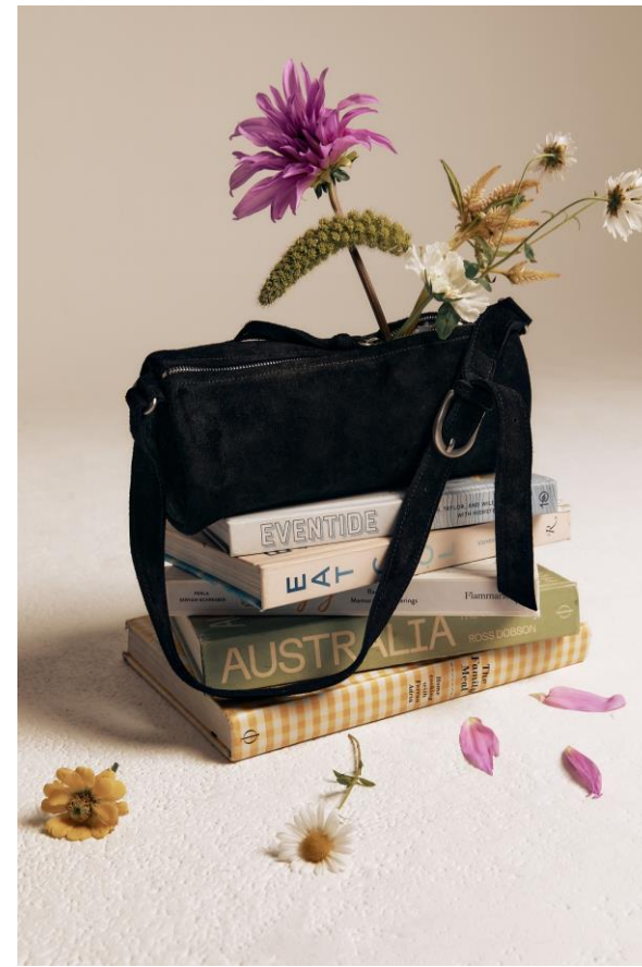
PILLOW BAG (BLACK) PRICE :158,000 WON