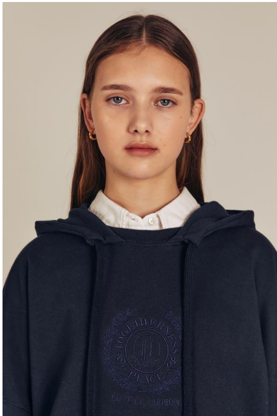
LOVE MUSEUM HOODIE (DARK NAVY) PRICE :58,000 WON