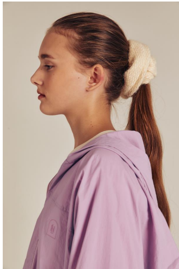
TWEED WOOL SCRUNCHIE (IVORY) PRICE :17,000 WON