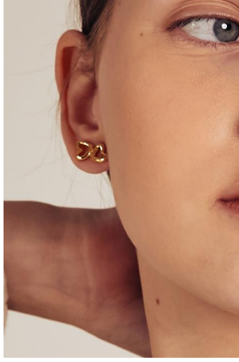
FACE LOVE EARRING (GOLD) PRICE : 55,800 WON