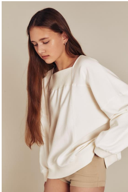
BRUSHING SQUARENECK SWEATSHIRTS (IVORY) PRICE : 78,000 WON