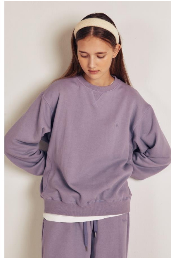
TWEED WOOL HAIRBAND (IVORY) PRICE :16,500 WON