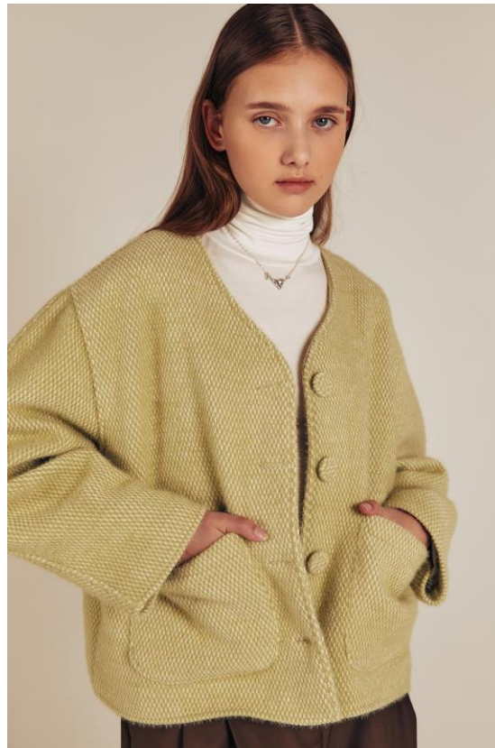
LEHAUL TWEED WOOL CROP JACKET (OLIVE) PRICE :143,000 WON