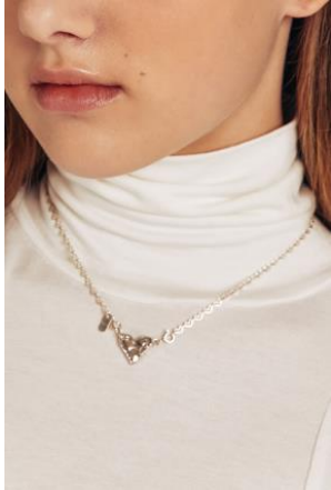
LOVE SUNSHINE SHORT NECKLACE PRICE : 68,000 WON