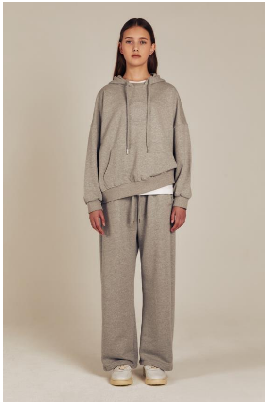
LOVE MUSEUM HOODIE (GREY) PRICE :58,000 WON