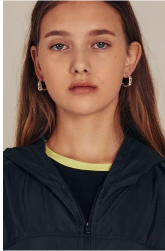
SILK FLOW EARRING (SILVER) PRICE : 68,000 WON