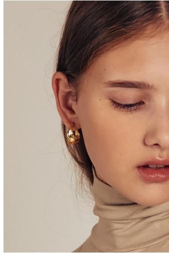
SILK FLOW EARRING (GOLD) PRICE : 78,000 WON