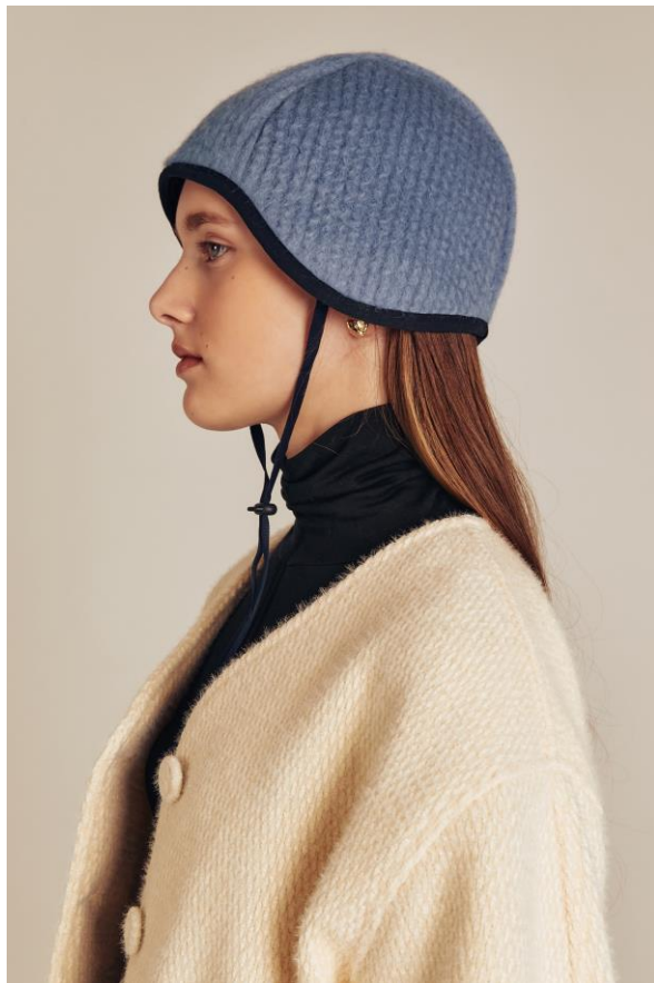
WOOL BALL CAP (BLUE) PRICE :16,500 WON