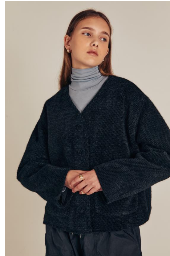
LEHAUL TWEED WOOL CROP JACKET (BLACK) PRICE :143,000 WON