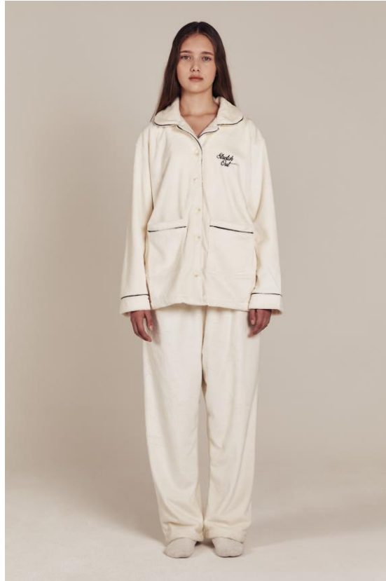
POLAR BEAR PAJAMA SET (IVORY/NAVY) PRICE :138,000 WON