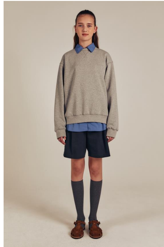
BASIC LOGO SWEATSHIRTS (GREY) PRICE : 68,000 WON