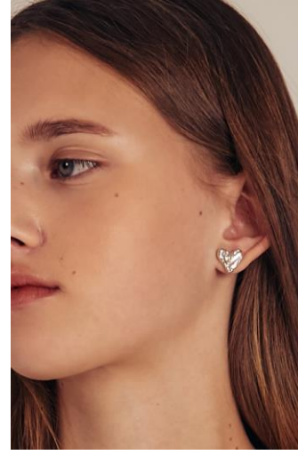
HEART EARRING (SILVER) PRICE : 55,000 WON