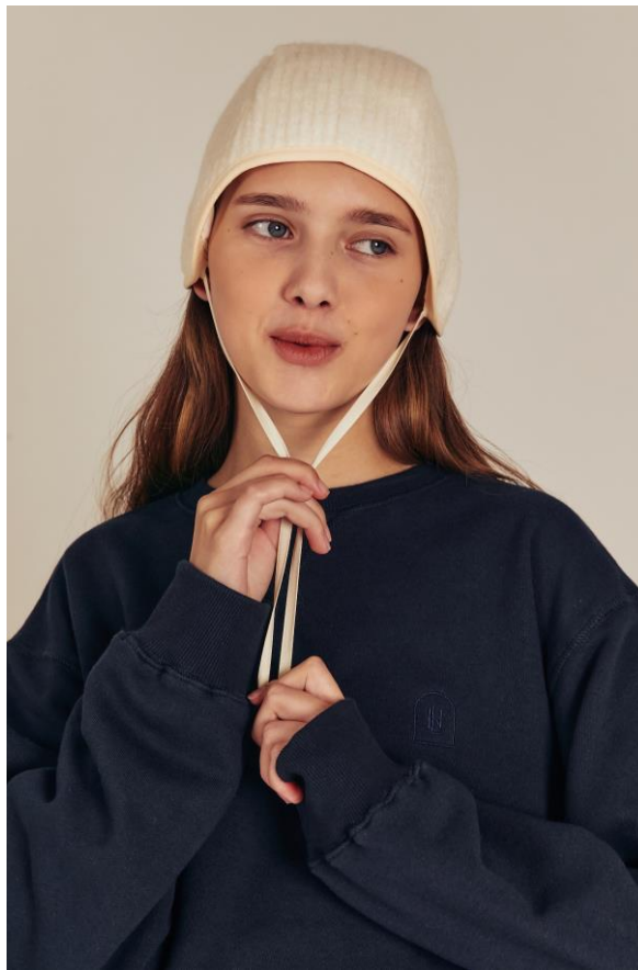
WOOL BALL CAP (CREAM) PRICE :16,500 WON