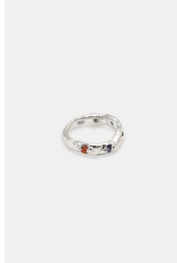
MULTI STONE RING (SILVER) PRICE : 98,000 WON