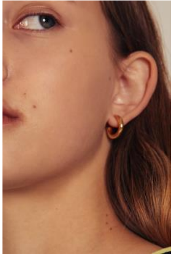
CLASSIC CURVE EARRING (GOLD) PRICE : 62,500WON