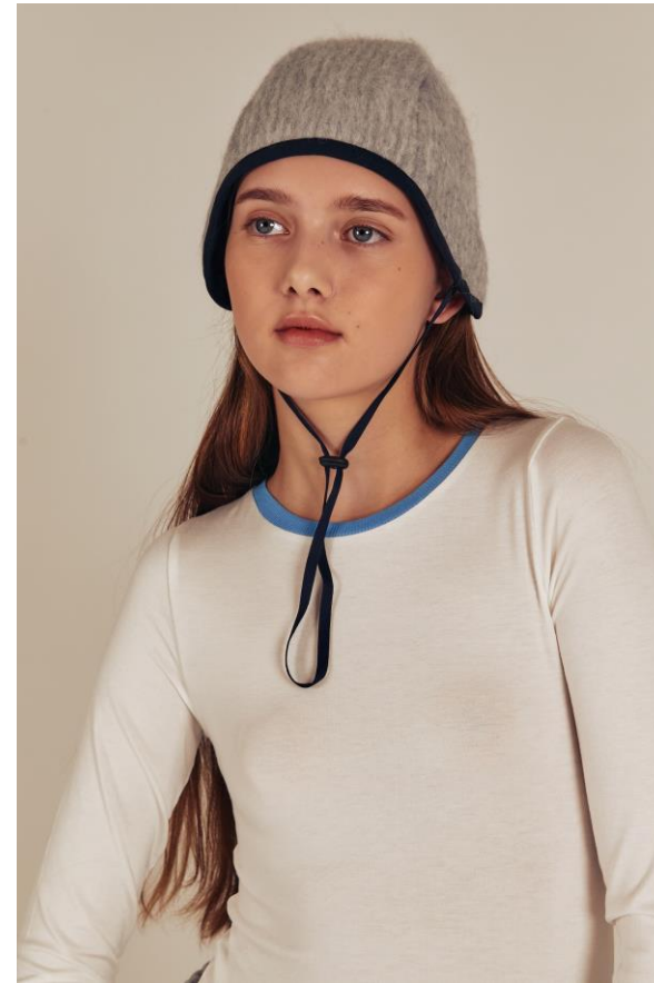
WOOL BALL CAP (GREY) PRICE :16,500 WON