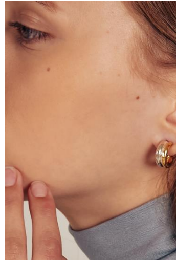
MORRY TWO RING (SILVER&GOLD) PRICE : 83,000WON