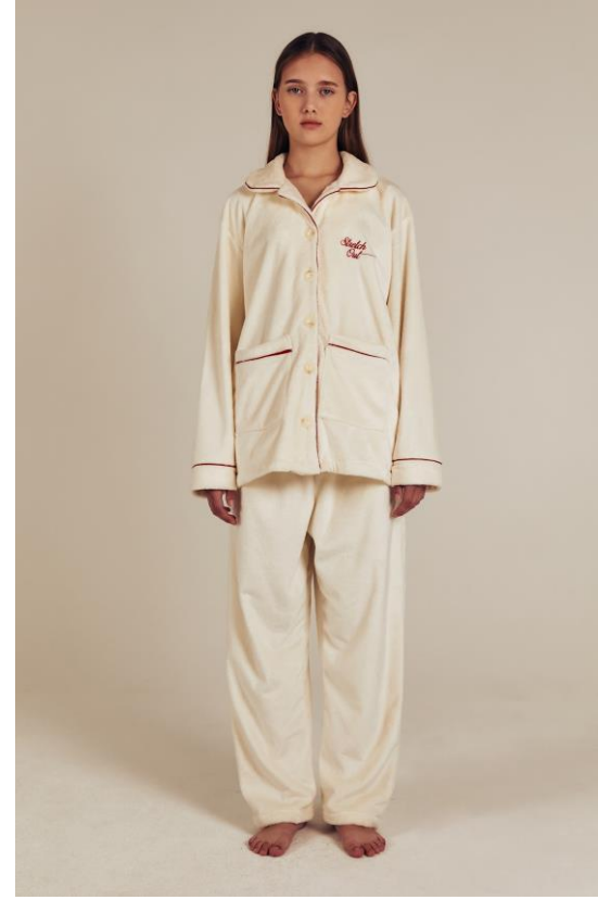
POLAR BEAR PAJAMA SET (IOVRY/RED) PRICE :138,000 WON