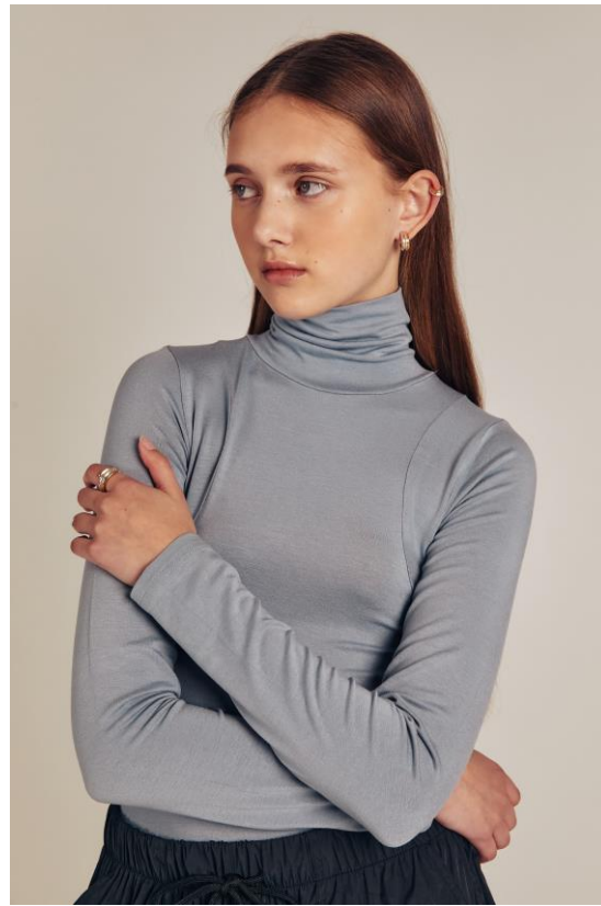
ROUND TURTLENECK SLIM TOP (BLUE GREY) PRICE : 28,000WON