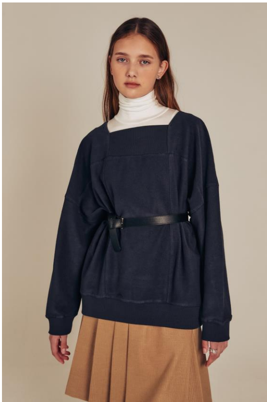
BRUSHING SQUARENECK SWEATSHIRTS (DARK NAVY) PRICE : 78,000 WON