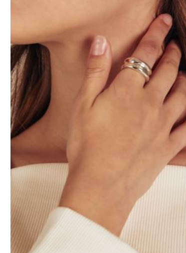
BOLD DOUBLE RING(SILVER) (SILVER&GOLD) PRICE : 68,000 WON