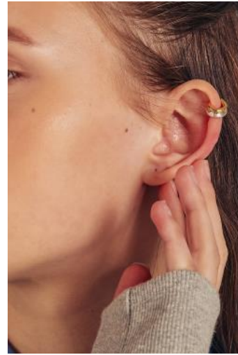
MORRY EAR CUFF (SILVER&GOLD) PRICE : 49,800 WON