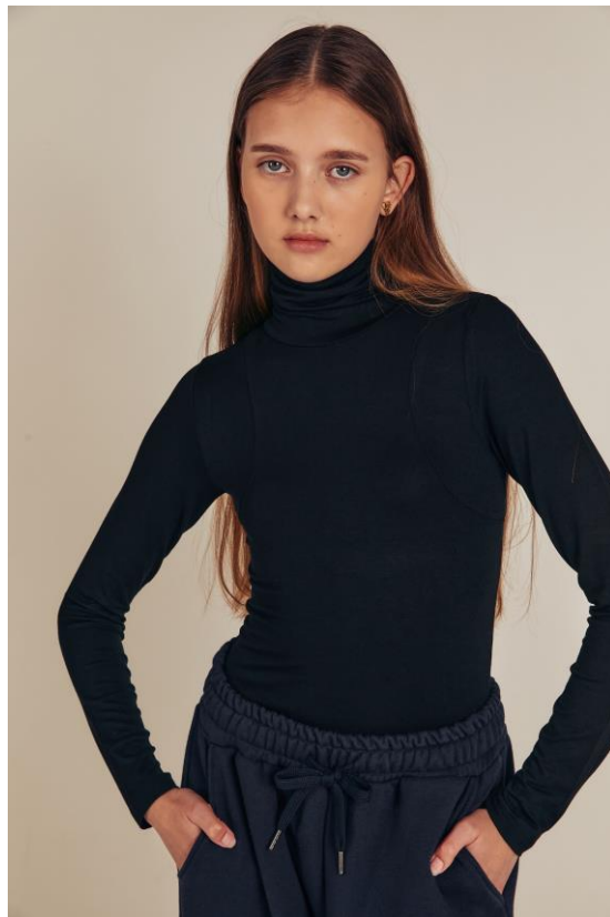
ROUND TURTLENECK SLIM TOP (BLACK) PRICE : 28,000WON