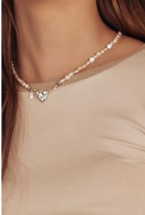
PEARL BOLD HEART NECKLACE PRICE : 95,000 WON