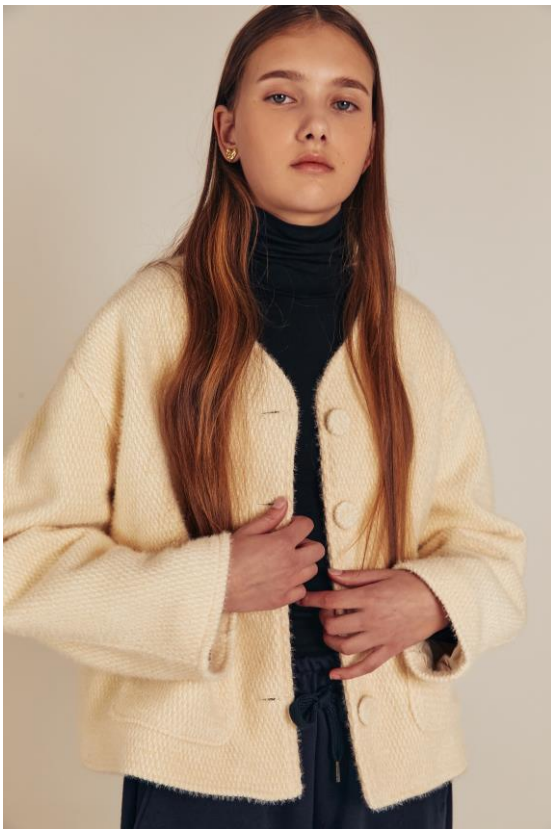
LEHAUL TWEED WOOL CROP JACKET (IVORY) PRICE :143,000 WON