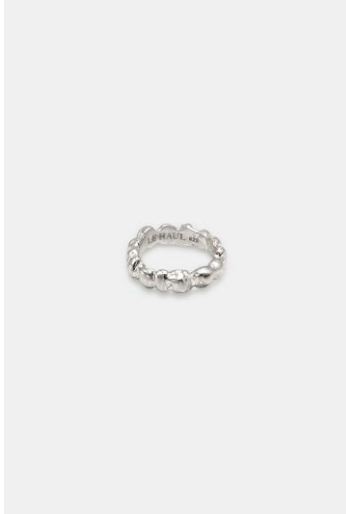
BLOOM RING (SILVER) PRICE : 61,000 WON