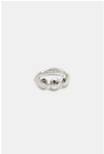
GURUMI RING(SILVER) PRICE : 56,500 WON